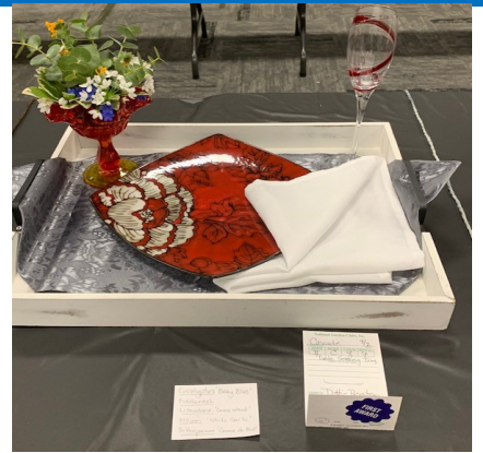
Functional Table Setting