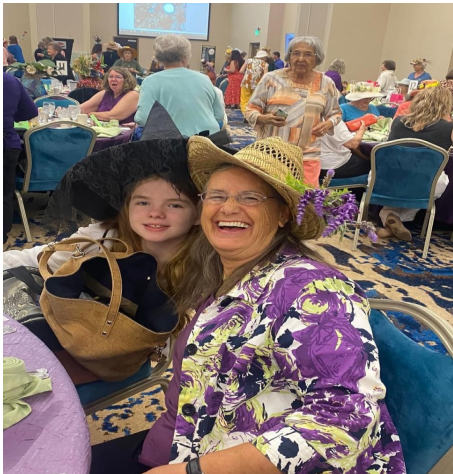
Fun times at last year's luncheon!