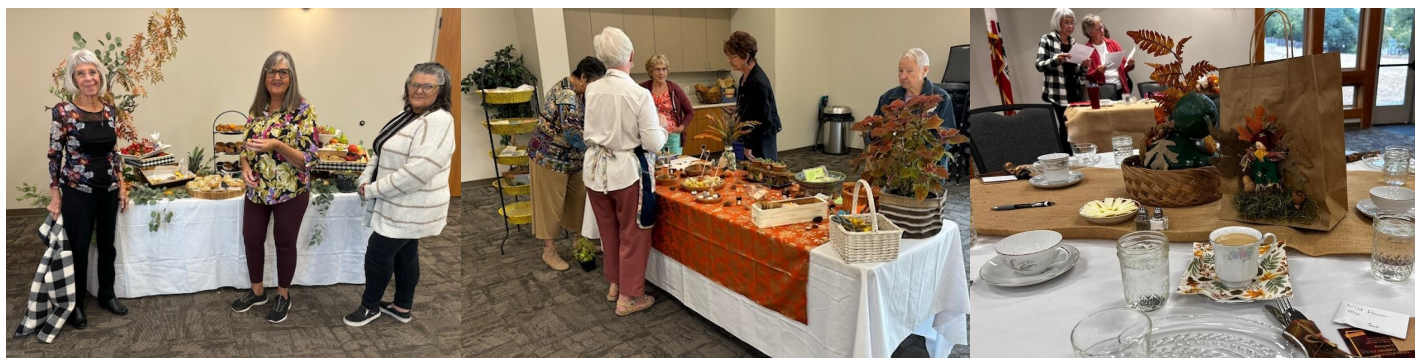
Good food, friends, seeds to share, and beautiful centerpieces to be won at the Cascade District

The next Cascade District meeting will be February 27, 2025, hosted by Red Bluff Garden Club. Save the date, and watch for more details soon.