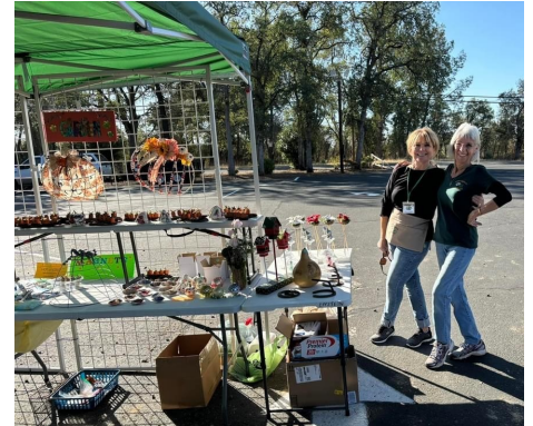
Great plants and crafts for purchase, and some ladies doing a "happy dance!"